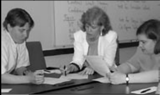
Three USCOTS participants working together in a breakout session

The breakout sessions were followed by Spotlight Sessions, which provided a means for individuals to present posters, demonstrations, slide shows, etc. We had over 100 spotlight participants at USCOTS, each one unique and informative. Lunch also involved statistical discussions, as participants were able to select from a variety of 15 different topics for table discussions, led by various members of the statistics education community, including the plenary speakers.