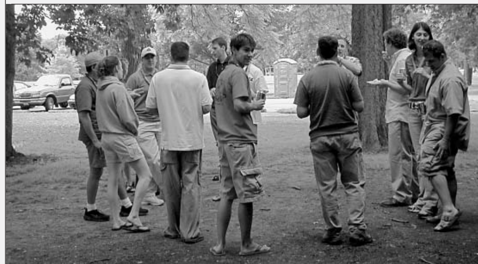
Students and faculty enjoying the beautiful spring picnic weather.