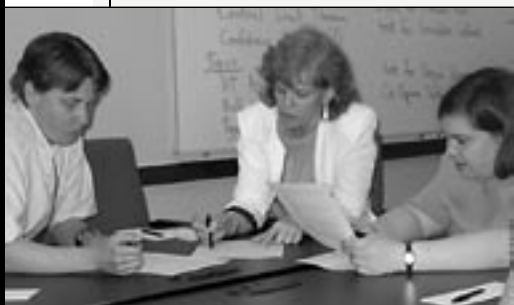
Three USCOTS participants working together in a breakout session

The breakout sessions were followed by Spotlight Sessions, which provided a means for individuals to present posters, demonstrations, slide shows, etc. We had over 100 spotlight participants at USCOTS, each one unique and informative. Lunch also involved statistical discussions, as participants were able to select from a variety of 15 different topics for table discussions, led by various members of the statistics education community, including the plenary speakers.