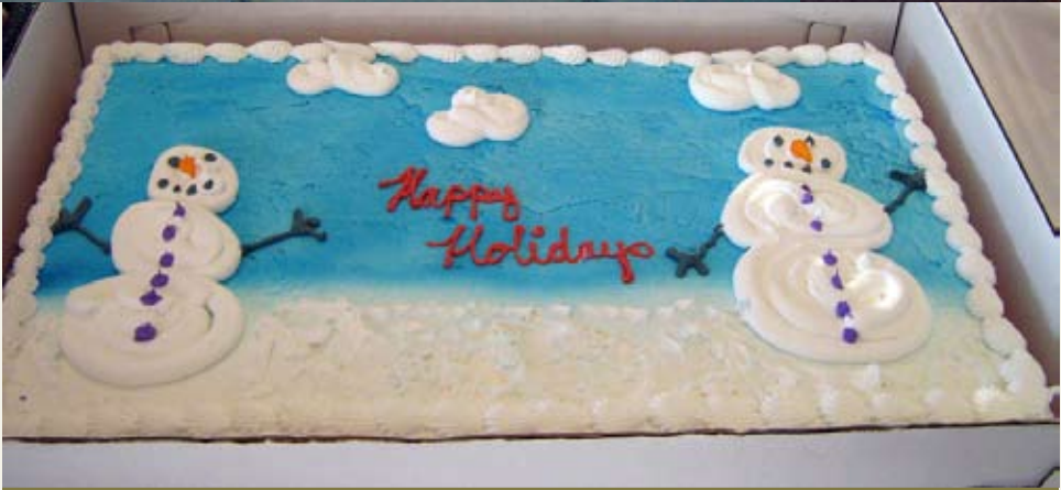
Enjoying food and freinds at the Department’s Holiday Party