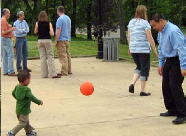
Having fun at the Department's Spring Picnic. (What is the probability of getting the stuck toy off the roof by throwing a ball at it? Apparently, it is quite low.)